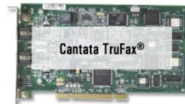
Cantata TruFax® (7.45" x 4.21")