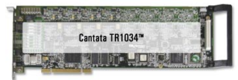
Cantata TR1034™ (12.37" x 4.22")

Delivering more board features in less space the IQ Express™ is 6.60 inches in length and requires 50% less real estate than traditional fax hardware options.